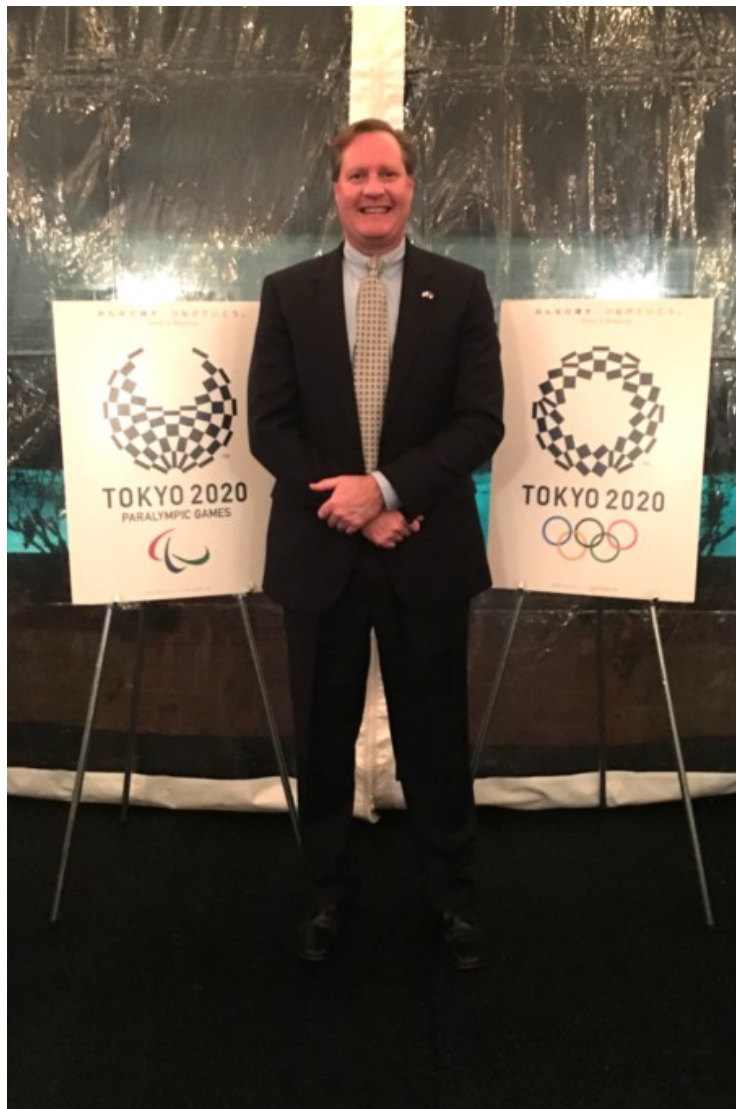
Robinson photographed in Tokyo in 2018 while promoting the Summer Olympics, before COVID rescheduled the Games.

“What’s rewarding to me? I think practicing law for sure is rewarding, but being on the other side of the table offers a valuable perspective, whether it’s in a business role or managing a nonprofit.”